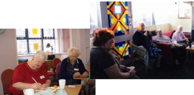
Space for Age Group

Special “Older person friendly neighbourhoods” workshops were held in different places in Benwell to try to ensure that older people with different needs, abilities and interests could participate.