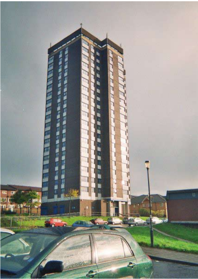
"Adelaide House is friendly. It was built originally for families - nowadays you have to be 50+ to live there."