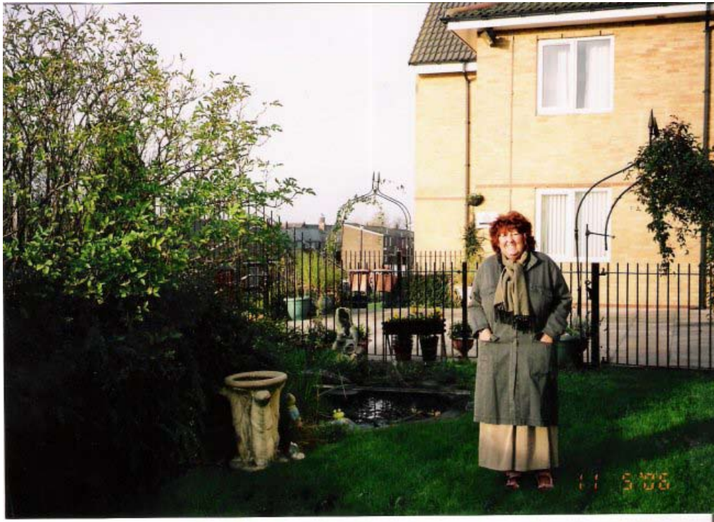
"My little plants in Clennel House. They benefit everyone and keep me out of trouble."