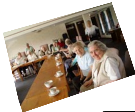
Shafto Court Residents