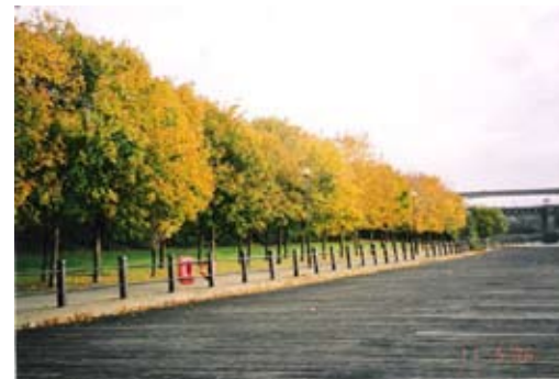
"Autumn trees on the business park - an area I love to go for walks with my grandchildren."