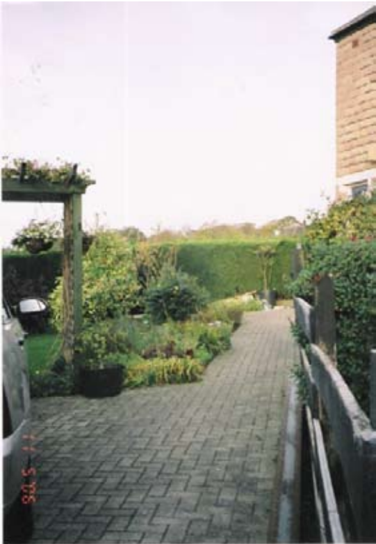
"I live in Clennel House now and I feel safe and secure. The warden keeps a close watch on everything so it makes you feel more secure."