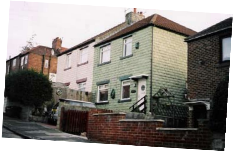
"Bilborough Gardens where I lived for 39 years. Moved because of the banks. Very sad to leave but the steep banks and deterioration of the area got me down."