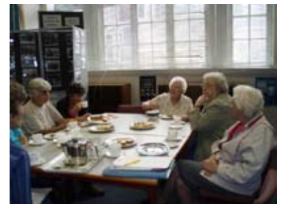
Benwell Library group