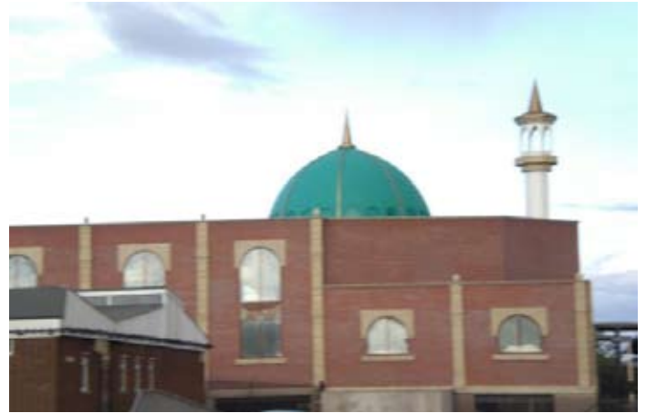
“There are a few local Bengali shops in the area, and the mosque is very near.”