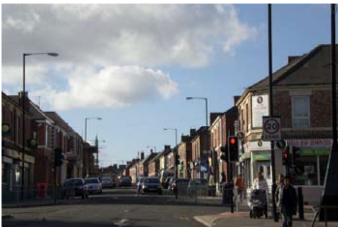
“My daughter takes me shopping on Stanhope Street for my fruit and vegetables. I buy my meat at the Halal butchers.”