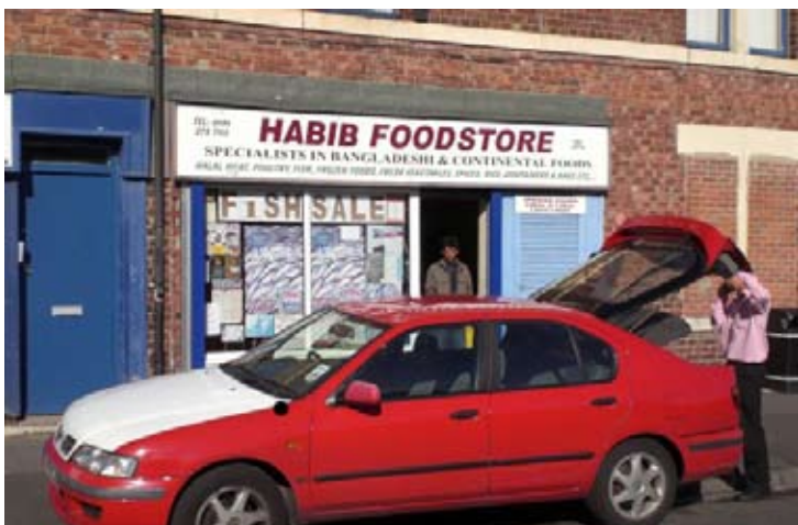
“I go to Netto as it's close, and I go to the Asian shops for my Halal meat and my vegetables. There are lots of Asian shops in the area.”